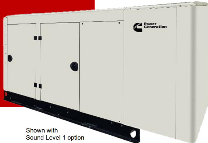
Shown with Sound Level 1 option