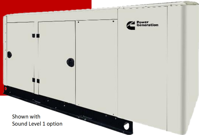
Shown with Sound Level 1 option