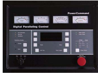
PowerCommand (3100) Control