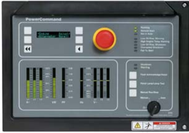
PowerCommand (2100) Control