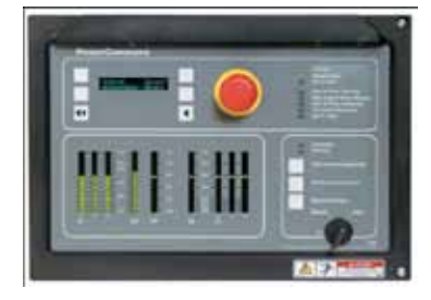
PowerCommand 2100 control operator/display panel