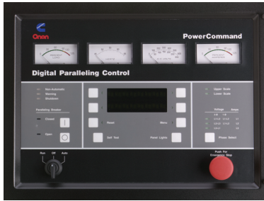
Optional Features Shown